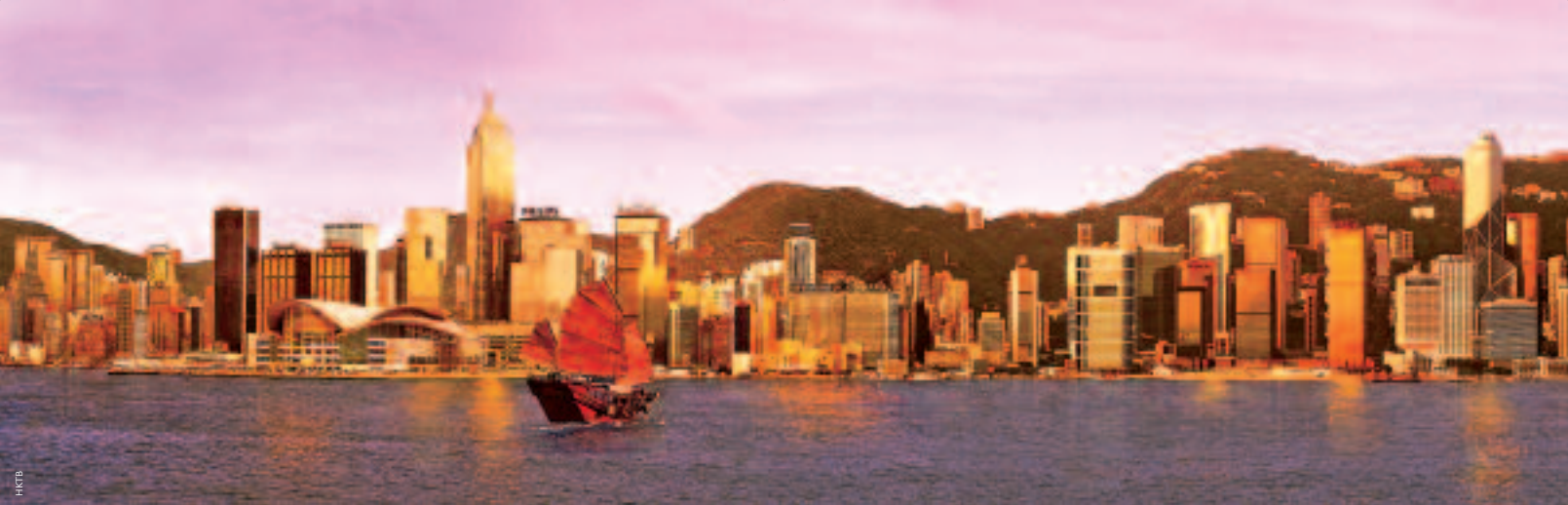
^ Victoria Harbor and Hong Kong Island