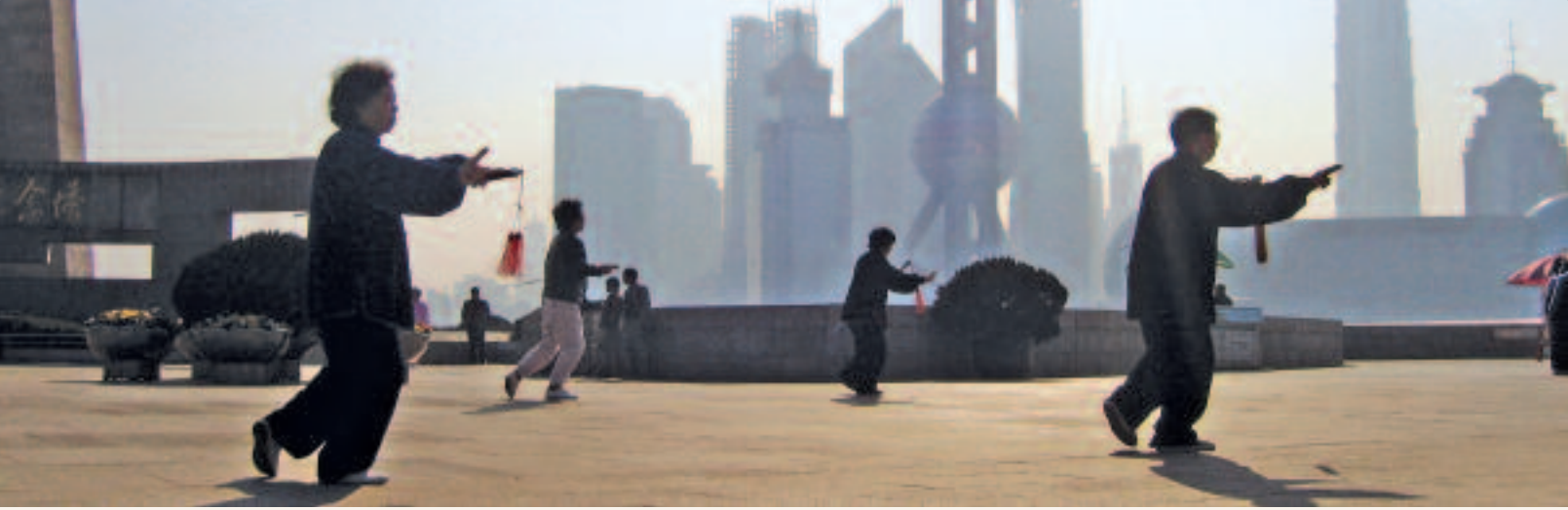
^ Shanghai at dawn